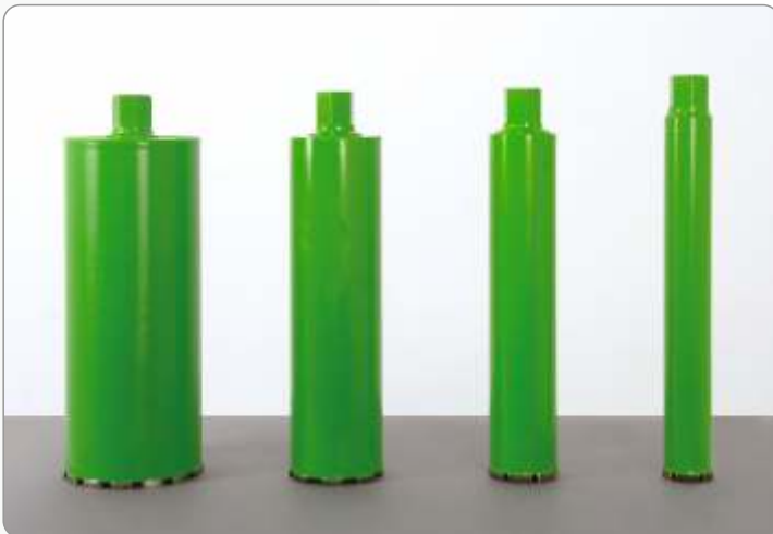
UTGD-0336 UTGD-0334 UTGD-0332 UTGD-0330