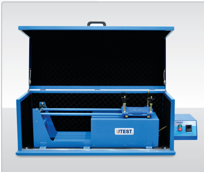
UTCM-0891 Jolting Table with Soundproof Safety Cabinet